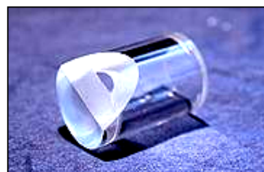
Duran glass O2k-Chamber

The O2k-Chambers are made of Duran glass and are closed by PVDF or PEEK stoppers which are as diffusion tight as titanium. The magnetic stirrer bars are coated by PVDF or PEEK. Teflon is avoided due to high oxygen solubility ( Gnaiger 1995 ). Viton O-rings are used for sealing the stoppers. Butyl rubber gaskets provide the seals for the oxygen sensors. These sealing materials minimize oxygen diffusion into or out of the experimental chambers.